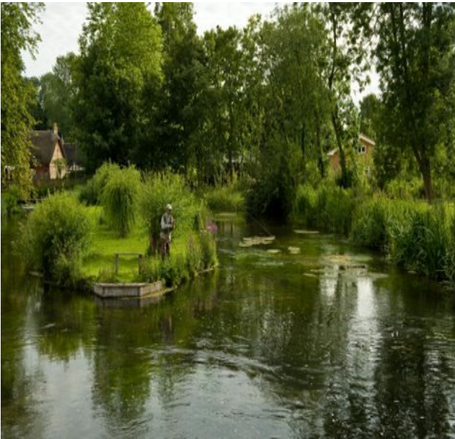
Island opposite Park cabin

Back on the concrete path, over the road and through the first garden (no fishing please) brings you back to the cabin. Here you have the option of fishing from the island; the pool at the top is fantastic.