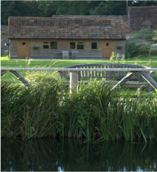
Priory cabin from river

The cabin is just slightly over half way up the beat; as you stand in front with the cabin to your back the river is at the end of the mown grass. There is a seating area by the river which is a good place to see the river and relax when you first arrive.