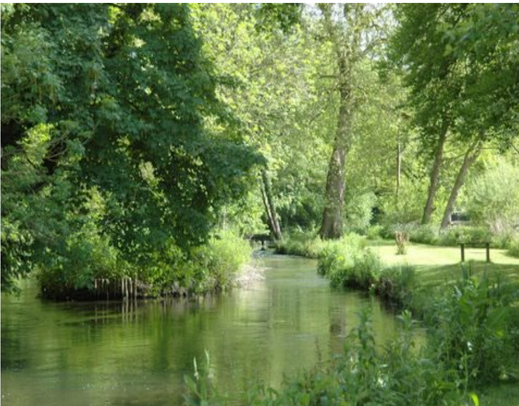
Second island with view to top of Park beat

The Park Beat cabin is fully equipped and there is a WC for fishers located near the offices (see map for details).