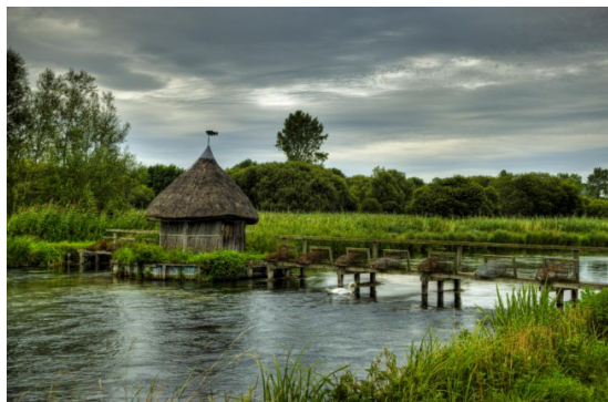
Leckford eel traps

The river rises in the village of Ashe, and flows west through the villages of Overton, Laverstoke, and the town of Whitchurch, before joining with the Bourne Rivulet at Testbourne and turning into a more southerly direction. It then flows through the villages of Longparish and Middleton to Wherwell and Chilbolton, where the Rivers Dever and Anton contribute to the flow.