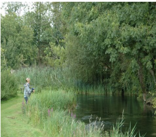
Start of Priory beat

To a great extent I would repeat my advice for the Park beat on how to fish as this is classic sight fishing and as such there are no particular areas or spots that I would single out for attention. Just move upstream slowly, keeping your eyes peeled; the fish are generally steady surface feeders and easy to locate.