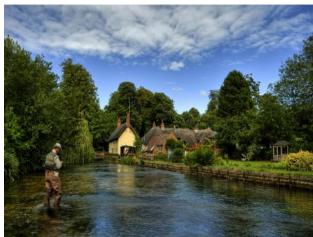
Park garden/wading section