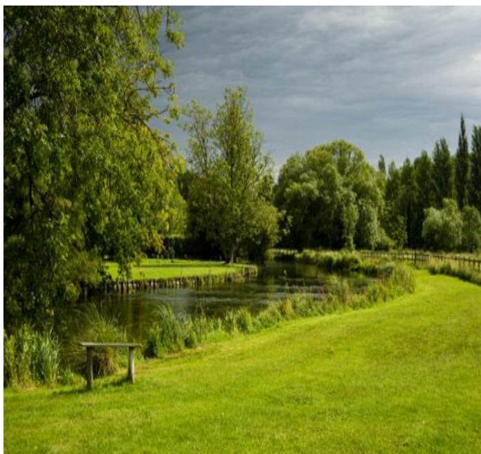
Lower section of Park beat

As you return to the garden section, please note that no fishing from the bank is permitted. Only anglers may enter the garden and no dogs permitted. However, you are very welcome to wade (see hatched area on map) and I can tell you that this is great for small, wild fish.